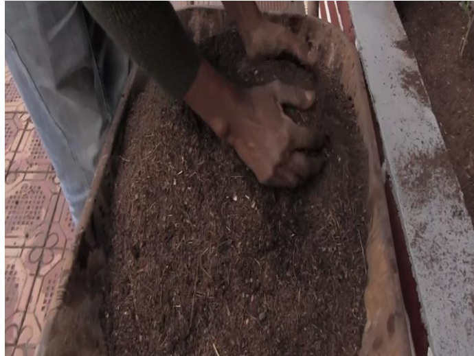
Compost application for flowers at the MoI