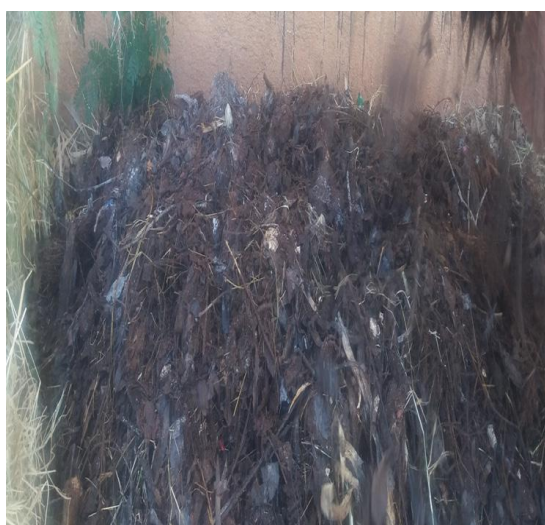
After three weeks

She added that members of the biofertilizer sub-committee have been involved in the production of compost and liquid fertilizer. Since February 2022, they have piloted compost production using domestic waste in some neighborhoods of Asmara selected by the MoA.